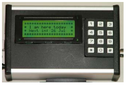
Figure 1: Context-Aware Desk Display

The iButton Context Capture application uses iButtons [11] to gather context information. iButtons are small, uniquely identifiable, devices. They may contain memory or have abilities like temperature sensing. iButtons may be identified and their memory content or sensor values read by a PDA with an adapter. The identity can be used to look up logically linked context information.