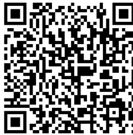
Fig. 1. QR code example containing a single use URL.

There are technologies that can improve the accessibility of support services by ensuring that survivors are not excluded because they do not know that the support service is there. These include Quick Response (QR) codes, as well as Near Field Communication (NFC) and Radio Frequency Identification (RFID) tags.