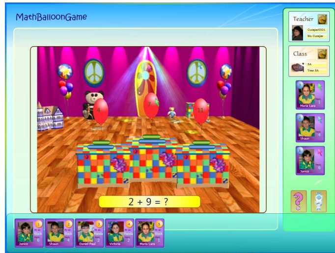
Fig. 4. The MathBalloonGame deployed within the student client

evaluation of the system's effectiveness in the long run. A more thorough study would need to be extended over the course of an entire academic term or year, incorporate applications offering a broader and deeper coverage of the curriculum, and objectively measure the performance of the participating students against a control group of similar ability (not exposed to the system) by means of common assessments.