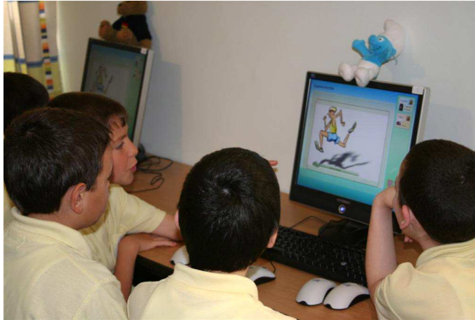
Fig. 3. Students attentively follow an educational slideshow presentation about nutrition

other through illustrations by means of an engaging Pictionary-like game which encourages collaboration and competitiveness amongst the students.